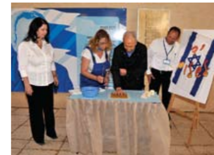
President Peres imprinting his palm