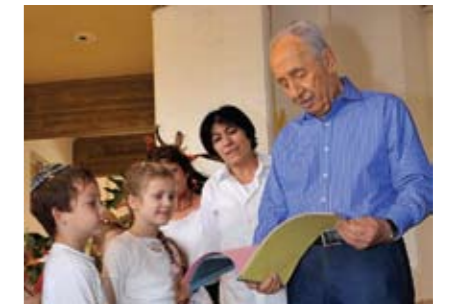
President Shimon Peres with the Shittim School Headmaster and students.