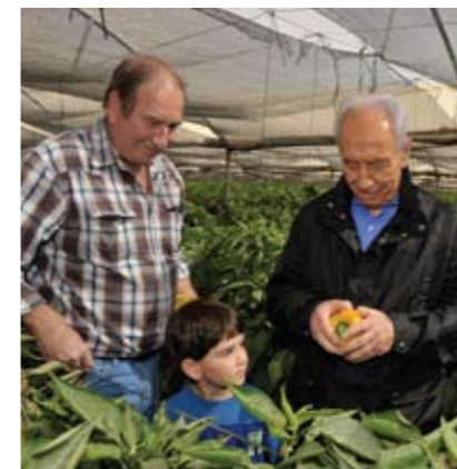
President Peres in a greenhouse in Ein-Yahav