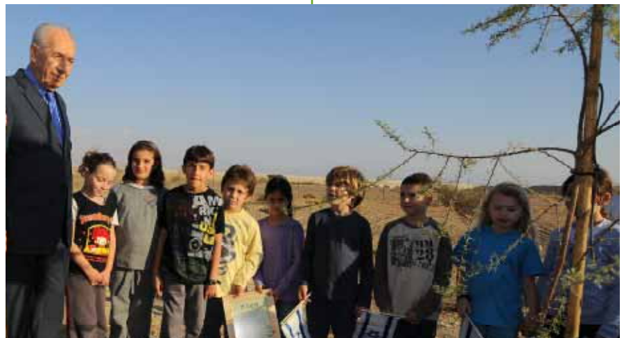
Mr. Shimon Peres planting an Acacia tree with children from Moshav Hatzeva during the Open Day 2011 opening ceremony.

Recently we have initiated, as part of our plan to increase the region's population, a program to attract engineers and other professionals employed in the various plants within an hour's drive of the area. These non-agricultural