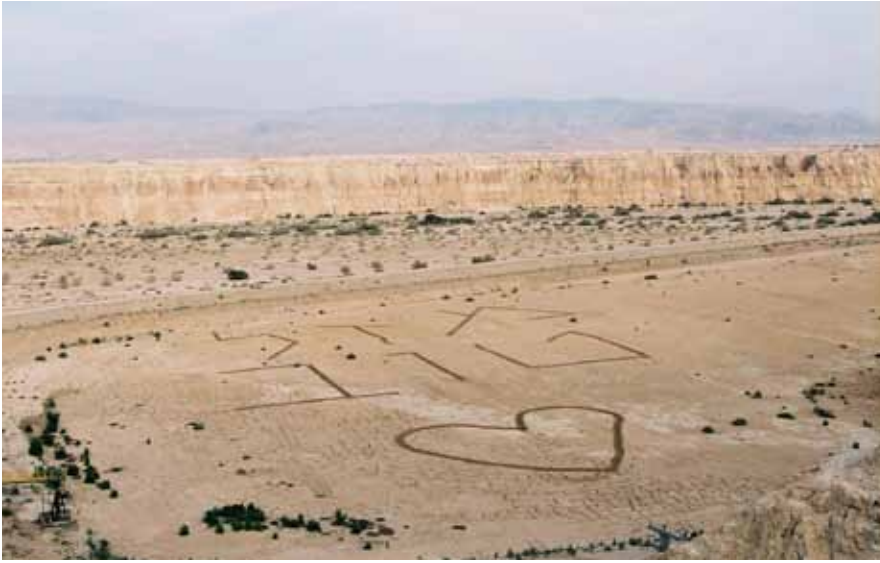
"Mazal Tov" ploughed into the dry Idan reservoir by the couple's friends on their wedding day

class, except for maybe two or three, all returned to live here with their families. They're all involved in agriculture, some helping on their parents farm, some starting their own farm in Hatzeva and a few, like us, were accepted to Moshav Idan to establish our own farm".