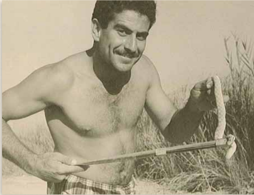
A smile worthy of a hundred pounds

a nice reward and the important goal at hand, (we were, after all, the target audience for the antidote) we provided the Institute with as many snakes as possible.