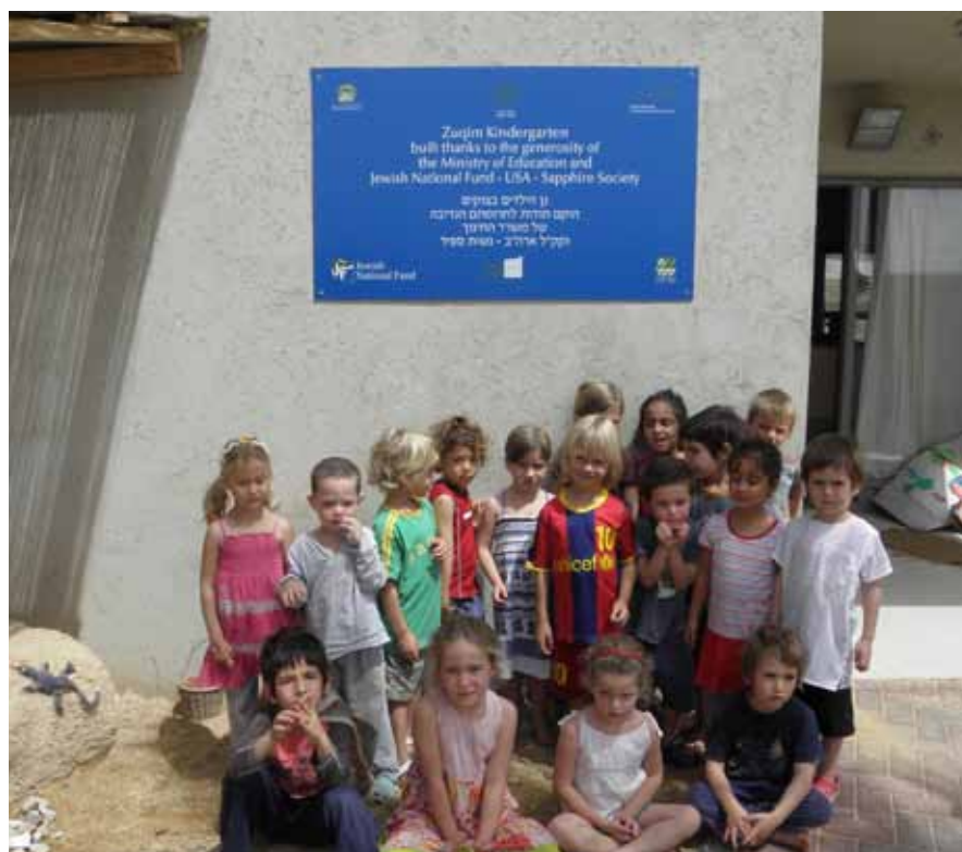
The new kindergarten in Zuqim.