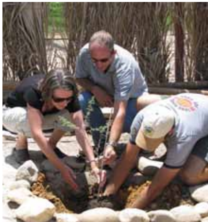
Australian Ambassador planting an Acacia tree in the Mechina.

Recently, there have been two visits from Knesset Members to the Mechina. Ze'ev Bielsky , former Chairman of the Jewish Agency, and Shaul Mofaz , former Chief of Staff and Minister of Defense. Each presented his convictions, and a lively discussion followed. The meeting with Mofaz was also joined by Chairman of Partnership 2000 from Australia,