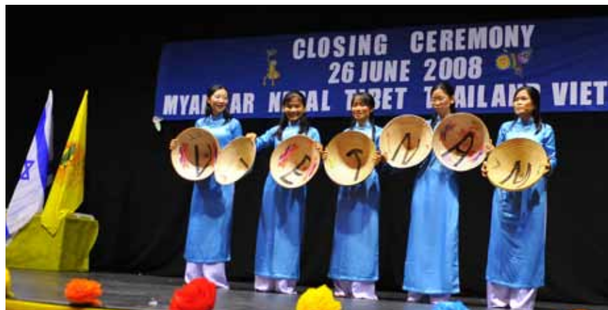
Vietnamese students dancing during the AICAT closing ceremony 2008

on the moshavim to modern agricultural techniques that are much more advanced than those applied in their countries.