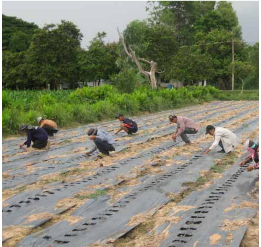
Arava Farm in Mahasarakham College of Agriculture and Technology in Thailand.