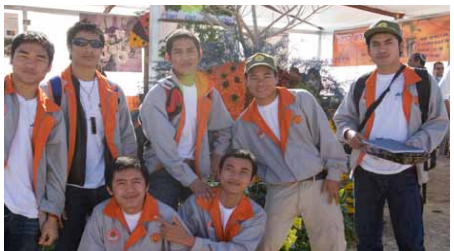
AICAT students during the Open Day

The farmers, who open their homes and farms to the students fulfill the crucial aim of exposing trainees to our way of life and are central to the success of the program.