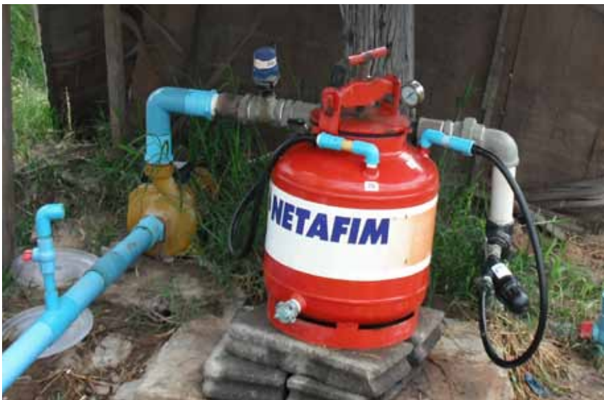
The students imported from Israel the drip irrigation system from Netafim.

“The main crop in our farm is sweet corn because in Thailand we have big demand but less supply. We have altogether 12.5 acre, on 4 acre we grow sweet corn using drip irrigation like we learned in Arava and all the rest using sprinkler irrigation. When we use both irrigation systems, sprinkler and drip, we learned that drip is better.